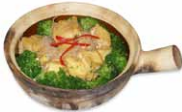
Broccoli with bean curd in casserole