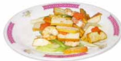
Fried celery with dried bean curd and shrimp